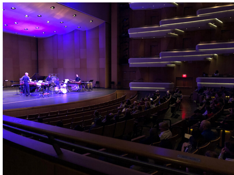
VTP performing "Akoya" by Brant Blackard with Blackard as the featured fall 2019 guest artist at the Moss Arts Center